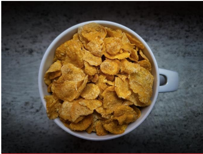
A bowl of cornflakes