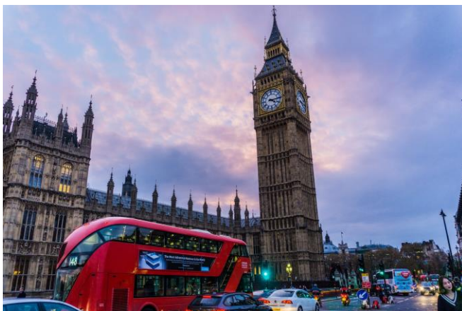
Big Ben, London, the United Kingdom

As I write this in 2021, London has a population of 8.9 million people. The River Thames flows through the city and it´s England´s longest river (215 miles long). The river has played an important role bringing and taking products to different places over the years. Nowadays, London is a very cosmopolitan city, and you can hear people speaking many different languages on the streets. Some of them are residents, others are tourists. There are many interesting tourist attractions to visit like: Buckingham Palace, where some members of the Royal family live; the London Eye, a big wheel where you can see the city from a capsule; the