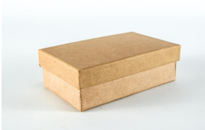
A yellowish box

“Look!” yelled Abigail suddenly. “I’ve found something.”