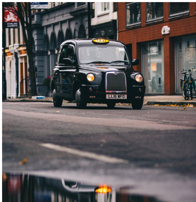
A London cab

My Grandparents and parents live in Tottenham, which is in North London. My Mum is a secondary school teacher. She teaches History to 11–13-year-olds. She really enjoys what she does. My Dad is a cab driver and knows London really well. He's been driving a London cab for 30 years.